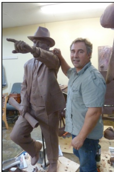
Rip with Lancaster