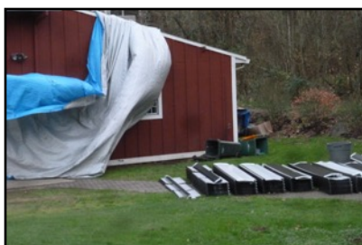
This is what the East Wind will do with a tarp, as pictured in December at the barn while workers fought to get a new roof on our exhibit hall.