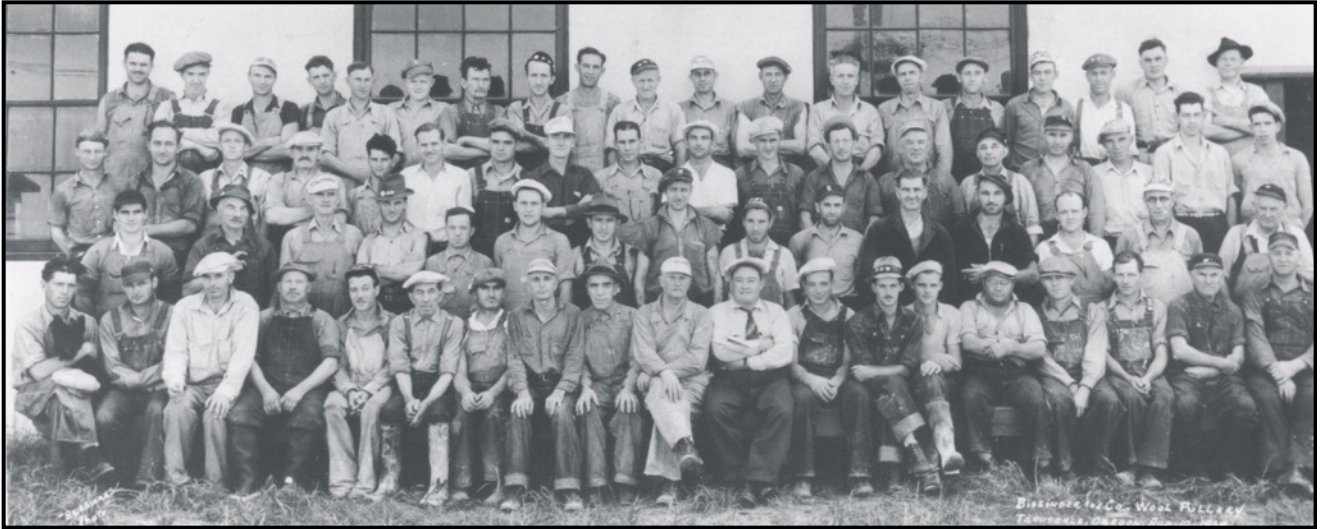
Workers at the Bissinger Wood Pullery, Troutdale, August 1938