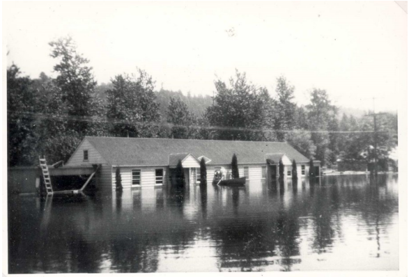
From the Harlow House, houses across the road during the 1948 Flood

Please note that the normal meeting date has been moved due to Easter Sunday. We will meet at 2 p.m. on April 23, 2006 at the Troutdale City Hall, 104 SE Kibling St., Troutdale, Oregon. The program is free and open to the public. Light refreshments will be served.