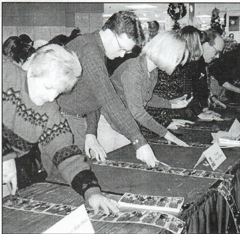
Troutdale Historical Society gained about $190 (we forget the exact amount) at Dec. 12 Oregon Lottery event called Scratch Off for Charity. Two-person teams had five minutes to scratch as many lottery tickets as possible for their charity.