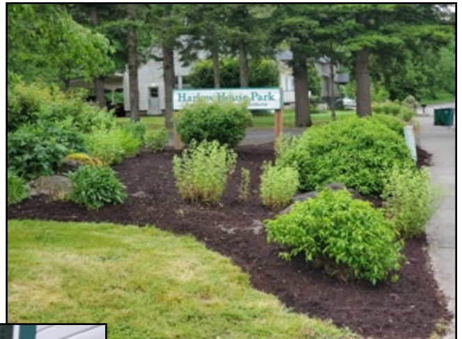
Harlow Park - home of Fred E Harlow House, Barn Exhibit Hall, and Robin's Way Trail in Harlow Canyon.