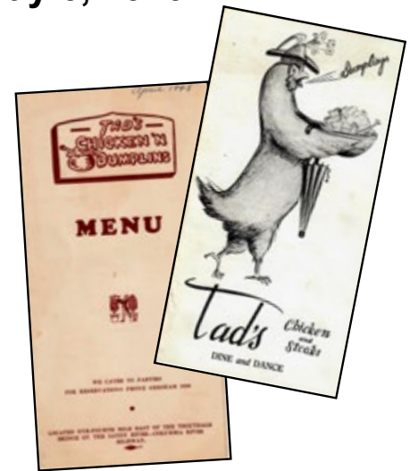
1948 & c1950 Tad's Chicken 'n Dumplins Menus

If you have stories you want to share about Tad's please send them to us.