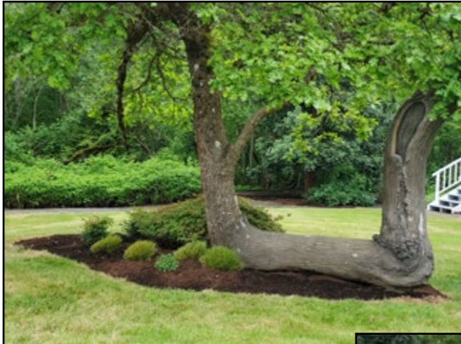
Recreation of Lovers Oak in Harlow Park, installed March 2018