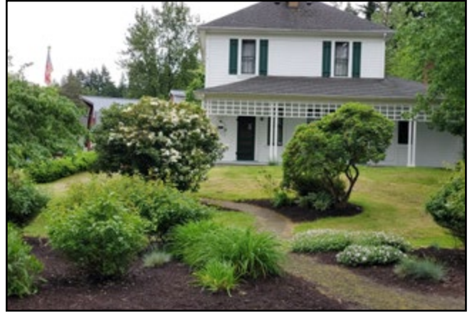
Fred E Harlow House, built 1900

We feel your support and are very grateful and appreciative. Thank you.