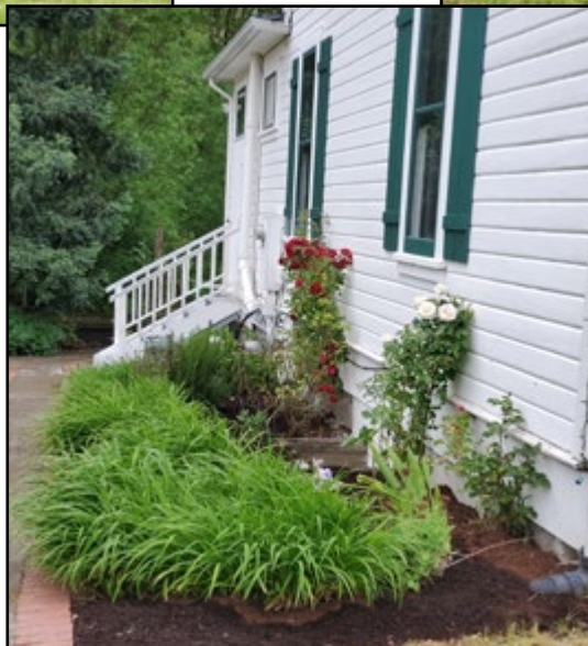
Fred E Harlow House, southside

Email troutdalehistory@gmail.com or call 503-661-2164.