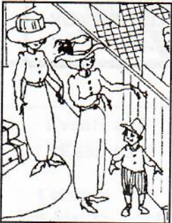
The Depot People