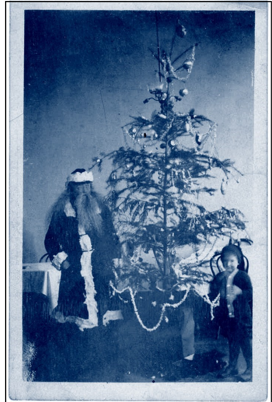
THS Photo #0425

If you can, please bring a plate of cookies to share, take some cookies home as well, and any left overs go to our friends and supporters.