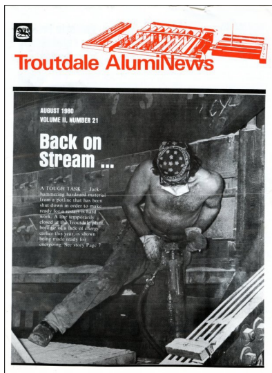
The August, 1980 cover from the Reynolds Metals in-house publication, AlumiNews

If you know someone who might want to attend, phone the THS office with contact information, 503-661-2164.