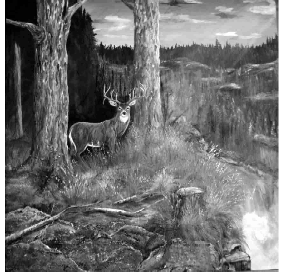
Cold Fall Morning