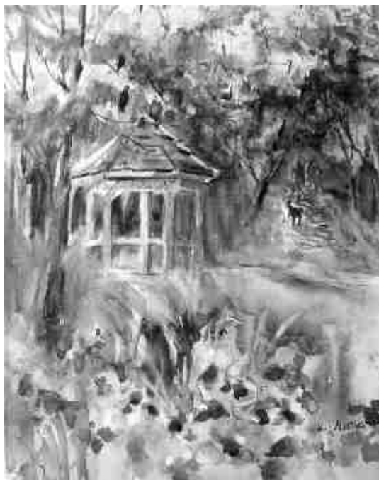
Gazebo at Harlow House

When she is diving she studies the natural feel of the water and the fish's natural environment.