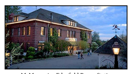
McMenamins Edgefield Power Station