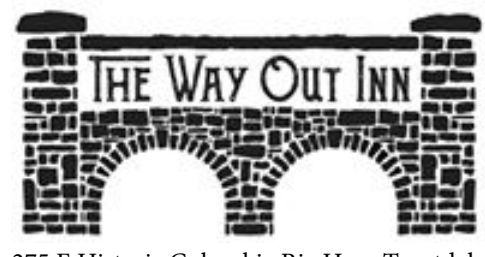
275 E Historic Columbia Riv Hwy, Troutdale